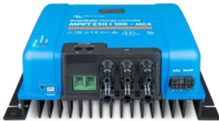
SmartSolar Charge Controller MPPT 250/100-MC4 without display