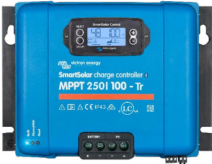
SmartSolar Charge Controller MPPT 250/100-Tr with optional pluggable display