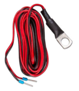
Temperature sensor for Quattro, MultiPlus and GX Device (such as the Cerbo GX)