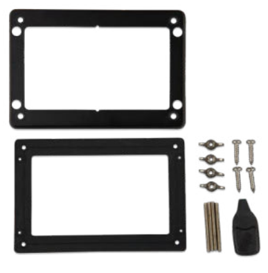
Accessories included with the GX Touch 50